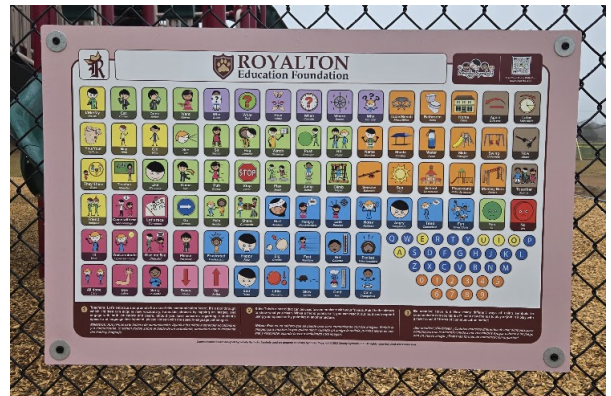
Two communication boards were purchased from a $3,500 REF grant!